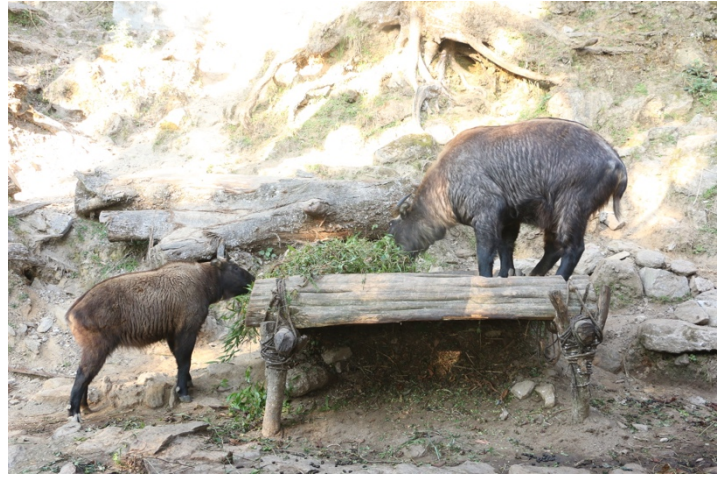
Repair of feeding platform