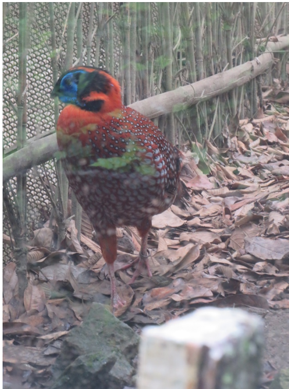
Dry leaf sheets for pheasants