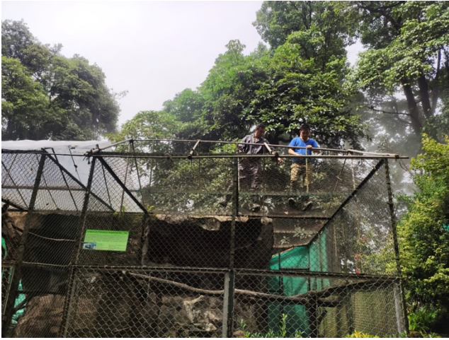
Covering the enclosure with tarpaulins